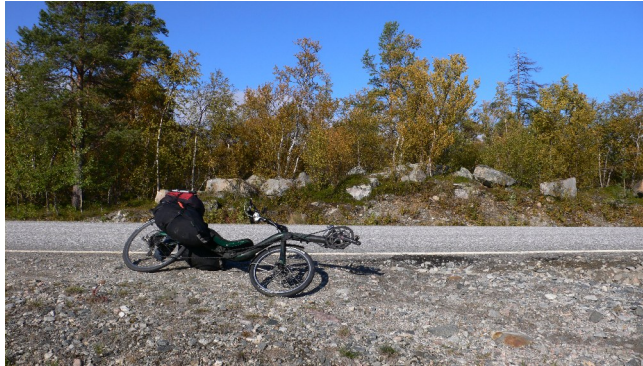
Sunny but cold. Finland.

All good and well, until rain approached. Halting to put on my raincoat seemed unavoidable. The very idea of halting was pure horror for the time trialist. Halting! Interrupting the pace! It felt like the most awful thing that could ever happen to me. Riding completely soaked for hours at 67 degrees north seemed preferable to standing still for three minutes. All the while, the traveller kept warning about getting ill and riding next day.