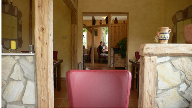
Lunch near Lüneburger Heide.

The feeling disappears quickly when I leave the Elbe behind next day. The land just doesn't inspire me. What is wrong? I have been in Germany numerous times and enjoyed it every time. Was the preparation of the journey not good enough after all? Is it loneliness, or remaining grief?