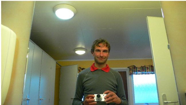
Resting in Alta.

the road. Through the trees I get a first glance at the fjord. My bicycle rolls a little more down the hill before I get the full view. It is breath-taking.