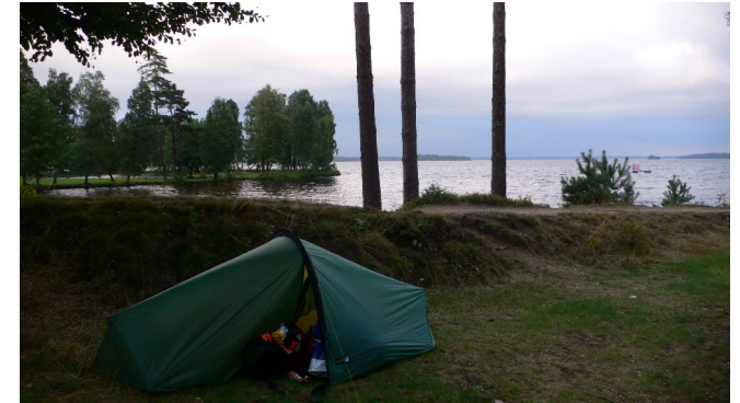
Camping near Lake Bolmen.

happen to me as well. I can feel lonely. Considering my personal situation of the moment, gloomy feelings could surface at any moment. They could even defeat me. What should I do if it happens? Could I talk