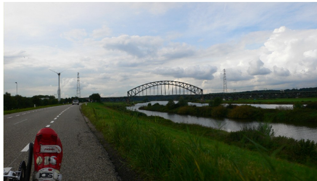
Along the great rivers.

On the map I see the small town of Culemborg. Too far away. But pretty. However, it is not a good thing to exhaust myself when someone comes to visit me on this very last evening. I lie down on the Fujin again and notice my high speed. Half an hour later I send a text message: "Culemborg".