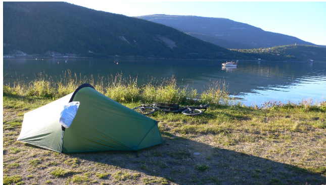
The last days of the Nordic summer. Rognan.

The idea was, by following the E6 instead of the coast, the climbing would be less strenuous. I observed last year that the roads through the valleys inland are flatter. What I forgot was the fact that north of the Polar Circle, the E6 is a coastal road too. Many times I find myself on a narrow section full of hairpins leading from the fjord into the mountains. Heavy trucks creep along in a low gear, their roaring engines producing hundreds of kilowatts while the cooling system has to work without wind. They're moving hardly faster than I.