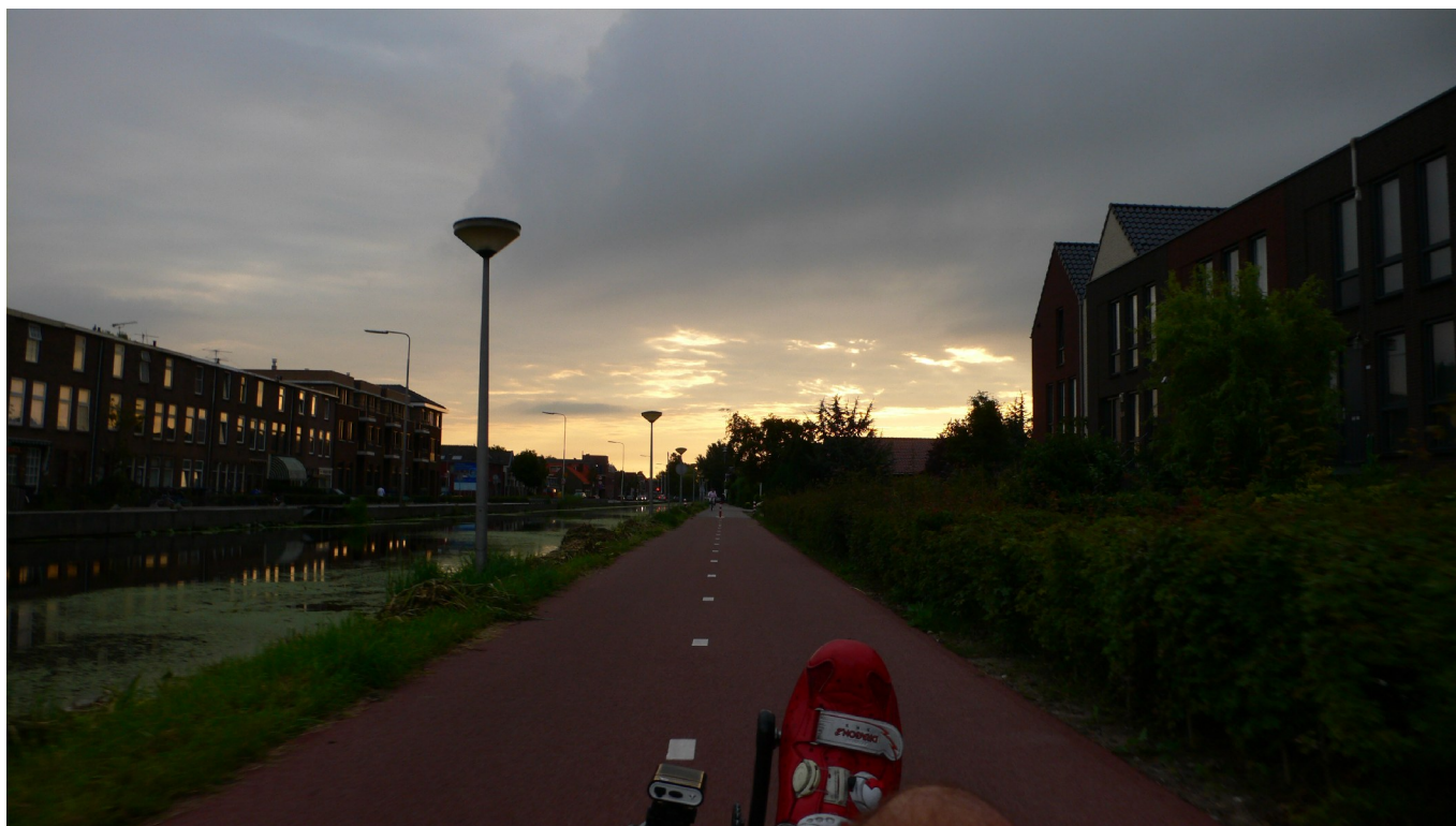
The beginning. Delfgauw, early in the morning.

I am not instantly accustomed to this country. Finding my way initially takes a lot of time and unnecessary kilometres. But even when I am a little further and my average speed goes up, I feel a little lost amidst the fields, pastures and small towns. Not until I pitch my tent on the bank of the Elbe river do I feel at home in the landscape.