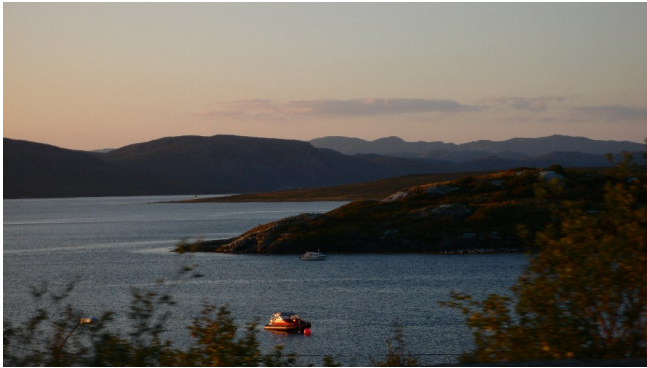
The Norwegian coast.

hand, my curiosity regarding Sweden and Finland needed to be satisfied. The Landscapes were pretty and peaceful. I did a lot of kilometres relatively easy. I set the discussion about the greenness of the grass aside and enjoy my first evening in Norway.