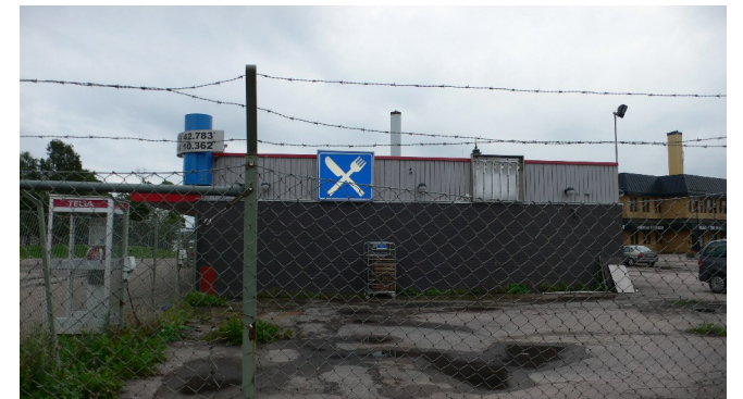
The other side of Sweden.

But the woods were not dark. Roads were never straight and boring. Lakes, rivers, swamps and agriculture alternated with the wood. Gloominess was a notion from a distant past. I was too busy looking around to feel lonely.