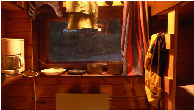
After the time trial. Spending the night in a cheap cabin.

This morning, as progress was better than expected, the time trialist saw his opportunity. Speed went up and became constant. Scarily constant. During two hours I passed the 10-km signs at :18, :38, :58. At CycleVision I have never been able to ride this rigidly.