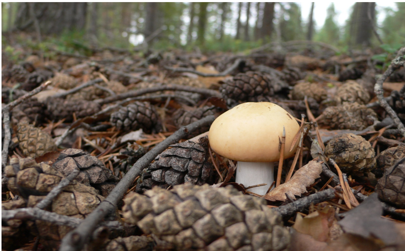
Autumn in Lapland.

The second day after a rest day is always hardest. The effect of resting has faded a little, but I haven't found back the ideal rhythm. This time the difficulty comes in the form of a struggle between the two cyclists in me: the traveller and the time trialist. The first one is always thinking about the long term, the rhythm of days and weeks. Getting up and going to bed on time, shopping late in the afternoon but not too late. The right moment for a coffee break, to pitch the tent