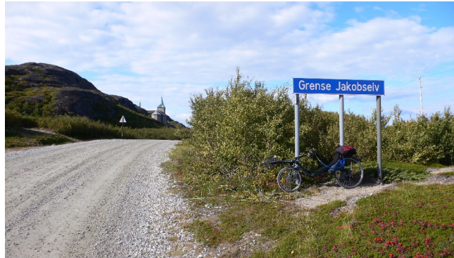
Grense Jakobselv. Het verste punt van de reis.

The sky is blue and sunny, but it's freezing. The Barents Sea lies in front of me. I have arrived, at the farthest place of my journey. Never was I this far from home, I can hardly comprehend it. The most remote hamlet of western Europe. On the other side of the little river lies Russia. The enormous country with