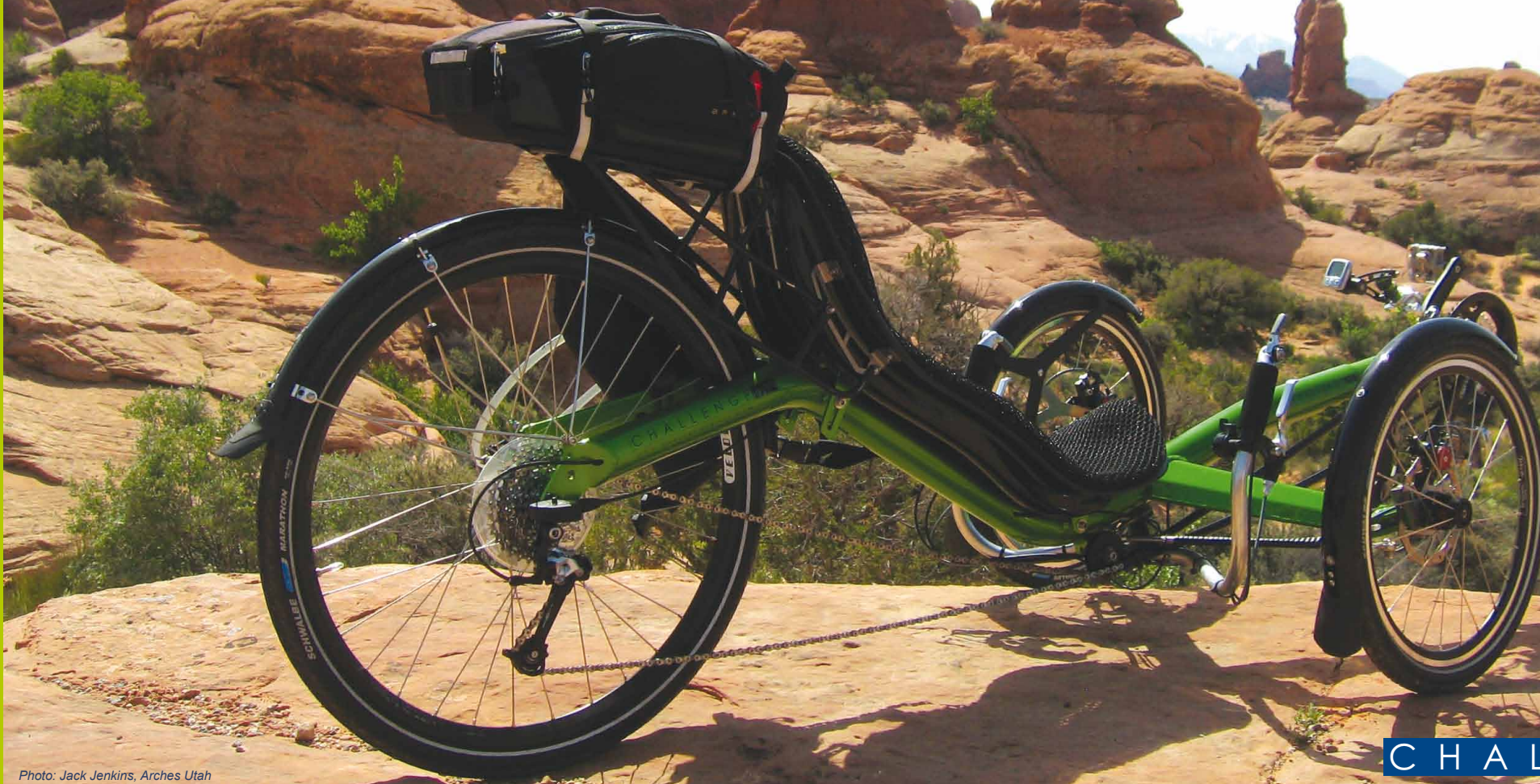
Arches Utah