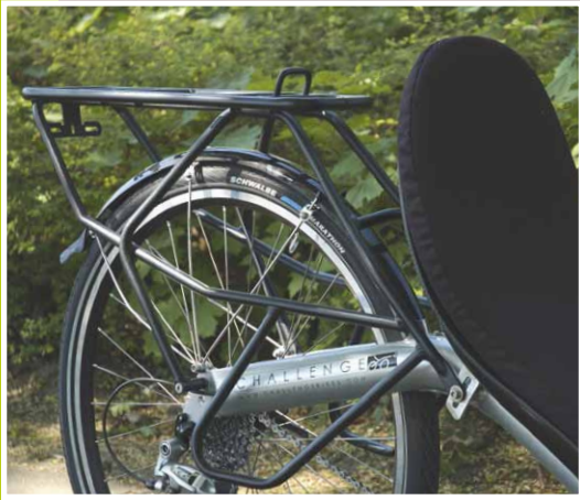
Voyager rack for Concept Trike