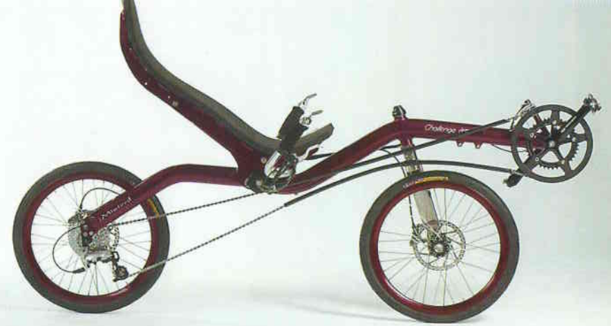
Basic Model 18 Speed, Above Seat steering (ASS) € 2.190,00