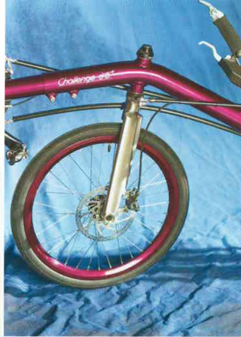
Katana Aeroblade stainless steel one-sided fork. Fitted here to a Mistral Deluxe USS.