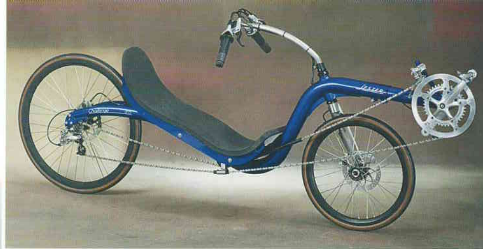
Basic Model 18 Speed € 2.490,00