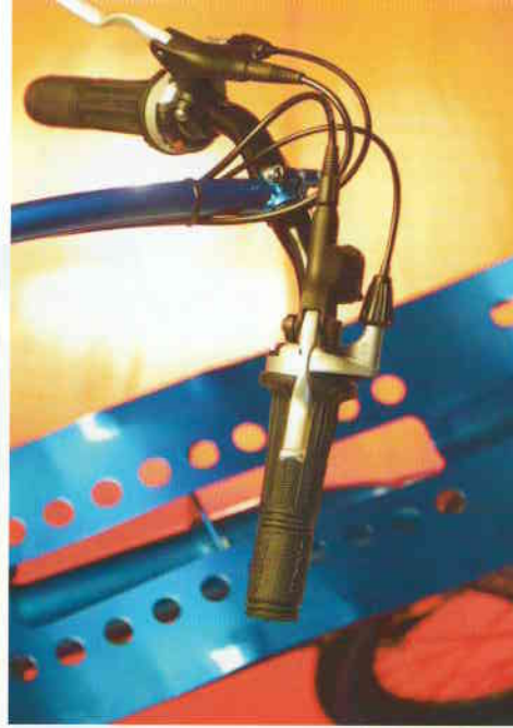
Grip shifters for quick and easy gear changes.