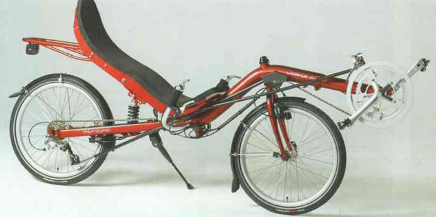
Basic Model 16 Speed, Under Seat steering (USS) € 1,750,00