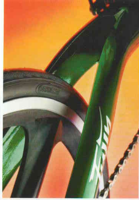
A splitted aluminium extrusion profile is the base for the Taifun, Fujin, Mistral Deluxe and Selran rear fork.