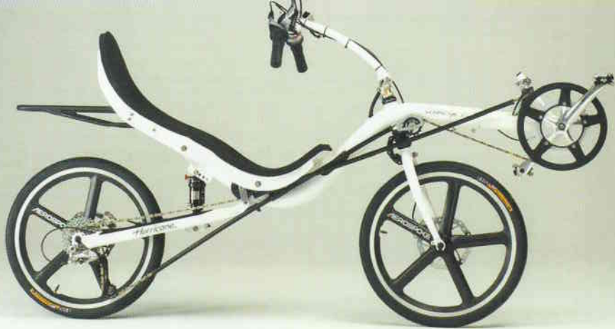
Basic Model 16 Speed, Above Seat steering (ASS) € 1,750,00