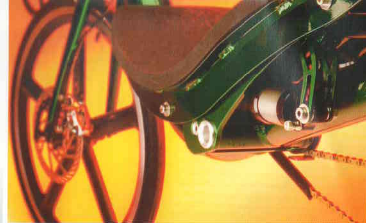
The suspension version of the Taifun and Fujin