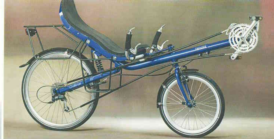
Basic Model 24Speed € 1.490,00

The Wizard is a great workhorse! The 26" rear wheel and solid rear rack make it ideal to take all of your luggage with you wherever you go. In the city, the seat height puts you at eye contact level with motorists, making the Wizard a great commuter. Out on the open road, that riding position allows you to sit back and enjoy the view. The straight chain line, protected by chainguards keeps things simple and clean, giving you a great many miles in between servicing. The Large rear wheel means that should you feel the need to cut across some rough ground, the rear derailleur is kept well clear of the ground.