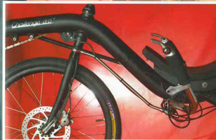
The Steering of the Hurricane Tour USS follows the line of the frame.