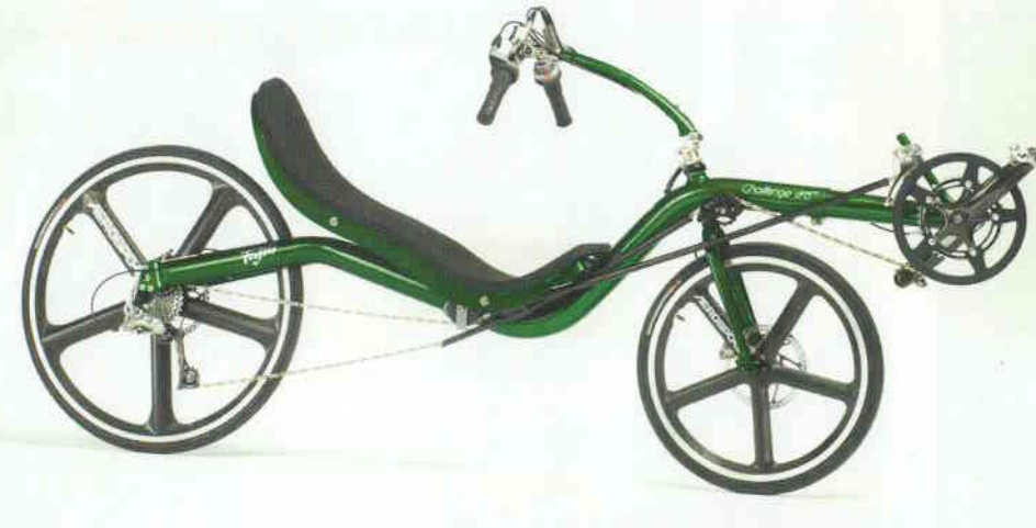
Basic Model 16 speed € 1.875,-

The Taifun was originally developed as a Hardtail Semi-Lowracer with 20" wheels front and rear for quick handling and blistering acceleration. It has always had far more potential than out and out speed. So we developed a complimentary suspension system that still retains the beautifully clean lines of the track version yet transforms the bike into a truly versatile all rounder. Race the Taifun or take it touring for a few months.... the choice is yours.