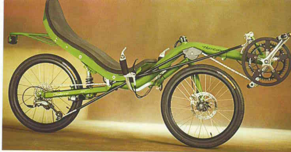
Basic Model 16 Speed, Under Seat steering (USS) € 1.750,00

The Hurricane Sport with Above Seat Steering is really the original Hurricane, a design that sets the standard for the "Quasi-Lowracer". With its short wheelbase and compact construction, it is a highly manoeuvrable, dialled in bike that begs you to go faster. Over the past few years, the Hurricane has proved itself as a reliable all-rounder and terrific travel companion. Its compactness and direct chainline allow for rapid acceleration and great climbing capabilities. Several customers have requested variations on the hurricane theme including undersat steering and a longer wheelbase; these are now options, which mean that the Hurricane can appeal to an even wider spectrum of riders than ever before.