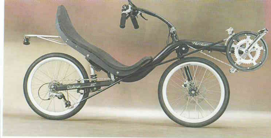
Basic Model 16 Speed, Above Seat steering (ASS) € 1.750,00