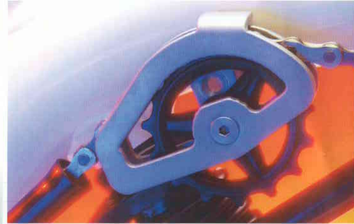
Light running wheel with in-molded ball-bearing and cage.