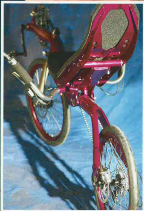
The Tightly designed wishbone rear end of the Mistral Deluxe, the rear suspension is concealed within the frame.