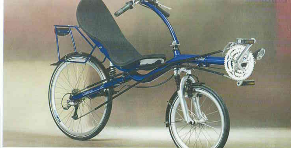
Basic Model 16 Speed € 1.490,00