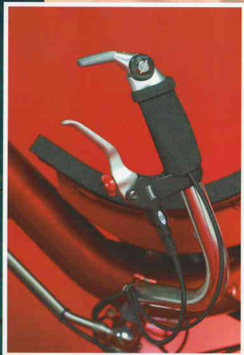
Bar end shifters for ergonomic gear changes on the USS options.