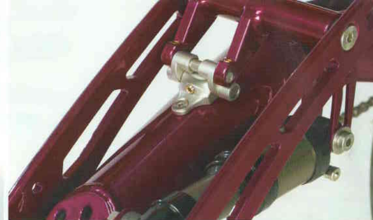
Construction of the suspended Taifun and Fujin