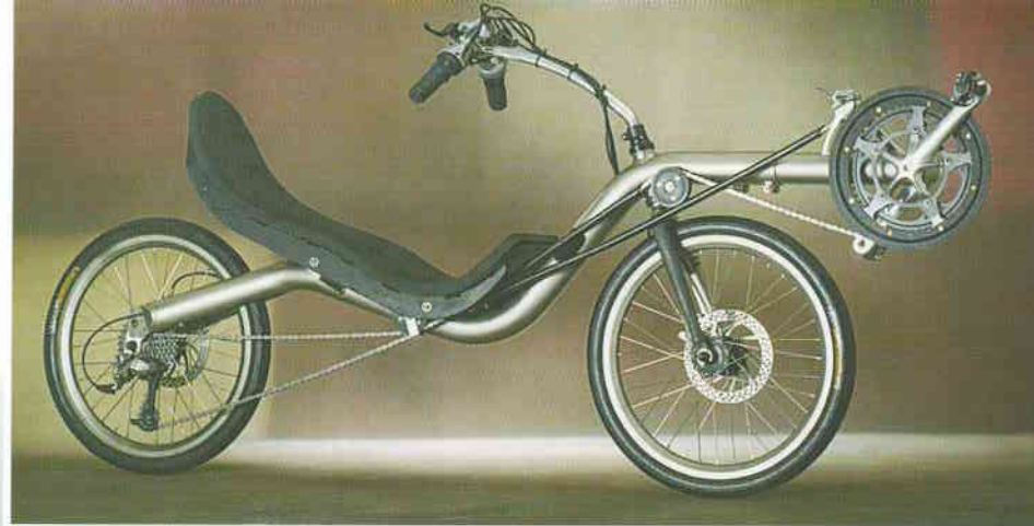
Basic Model 18 Speed € 1.990,00