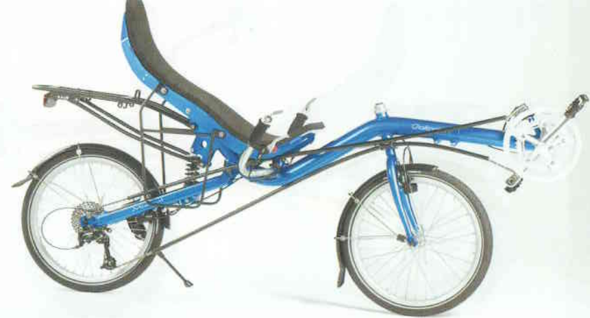
Basic Model 16 Speed, Above Seat steering (ASS) € 1.490,00